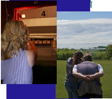
Learning how to shoot Handgun & Trap.