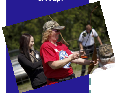
"Great day, great volunteers and instructors!"