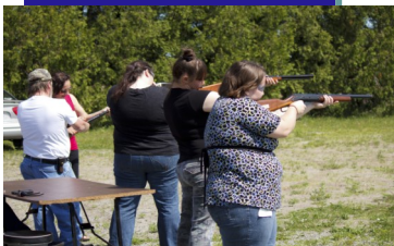
Shooting BB guns in the Tin Can Alley Event