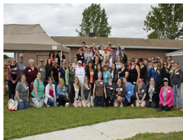
W.O.W. - June 2014

From there you will move on to the events of your choice, also all taught by our qualified instructors.